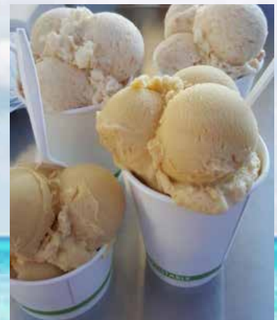
Ice cream 6