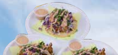
Baja Tacos fish 3 x 14.99