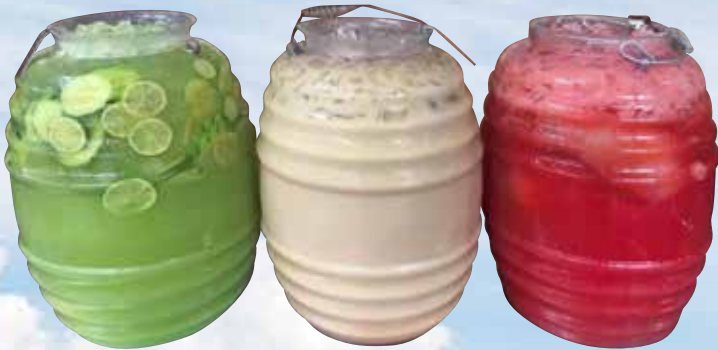
Mediana 4 Grande 6