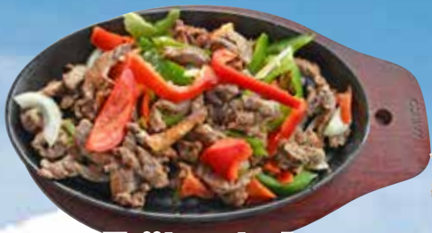
Fajitas steak 20