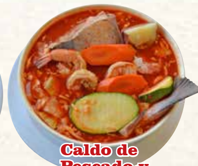
Caldo de Pescado y Camarón 23