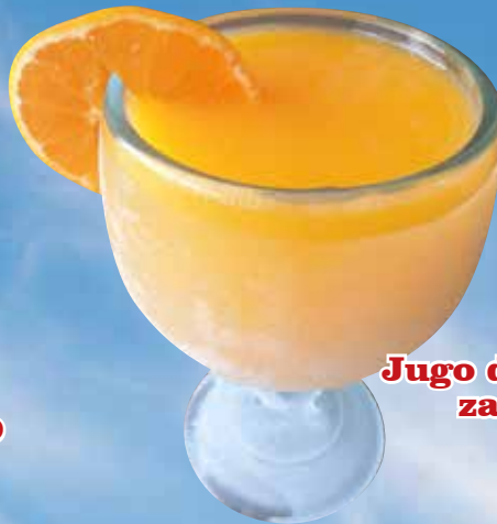
Jugo de naranja o zanahoria 10