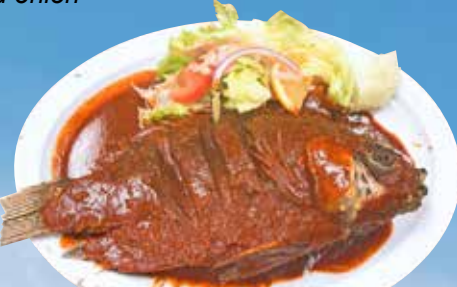
Pescado a la diablo 22