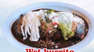
Wet burrito Mole 15.99