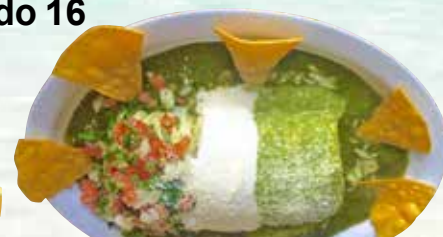
Wet Burrito meat 14.99