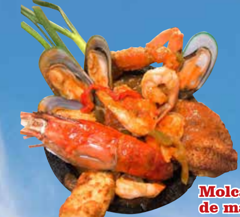
Molcajete de mariscos