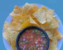
Salsa y chips 4