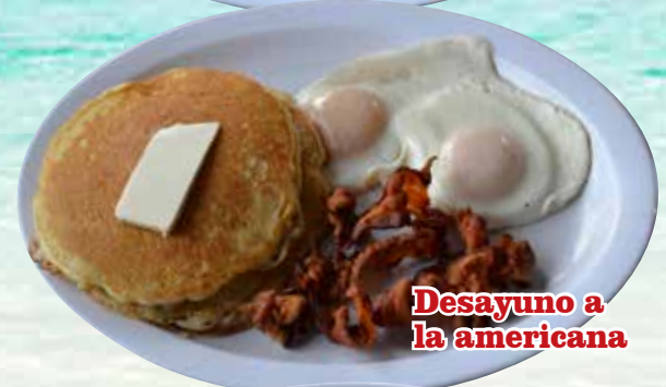
Desayuno a la americana