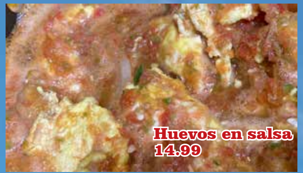
Huevos en salsa 14.99