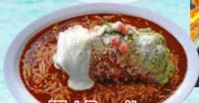
Wet Burrito with Shrimp or Fish 16.99