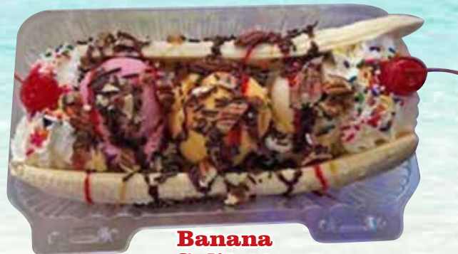
Banana Split 12