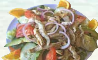
Ensalada de pollo asado 14