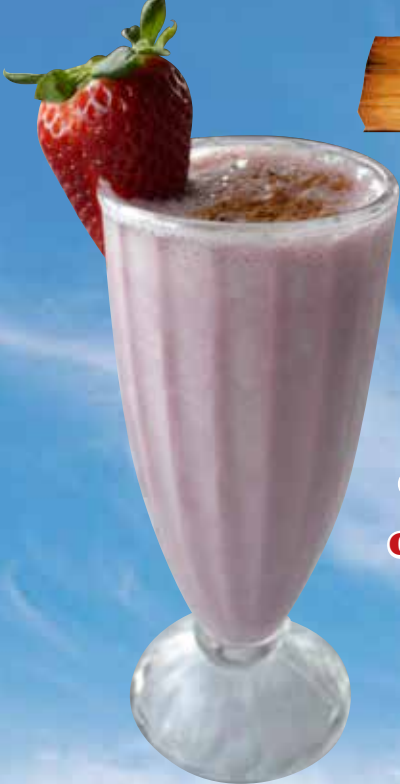
Licuada de frutas Chico 5 Grande 10