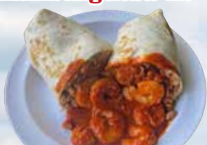
Burrito de Camarón a la diablo 14.99