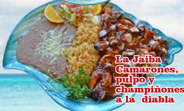
La Jaiba Camarones, pulpo y champiñones a la diablo