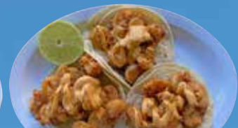
Baja shrimp tacos 3 x 14.99