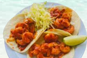
Tacos de Camarón a la diablo 14.99