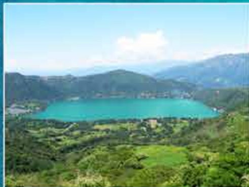
Laguna de Santa Maria del Oro Nayarit