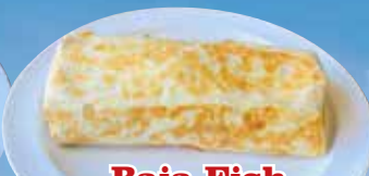
Baja Fish Burrito 15