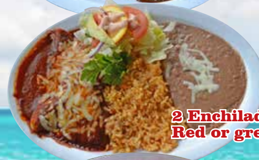
2 Enchiladas Red or green

This plate come with nuts, seeds, and spices. If you are allergic, please ask