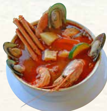
7 Mares 23