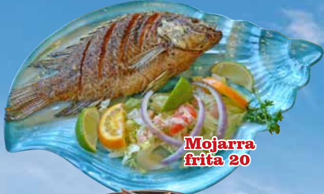
Mojarra frita 20