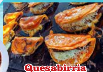
Quesabirria with consome 3x 19