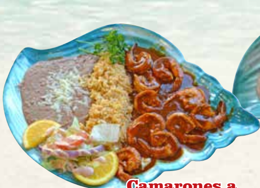
Camarones a la diablo