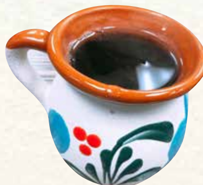
Cafe 4 Chocolate 6