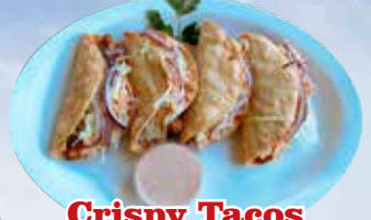
Crispy Tacos Fish or Shrimp order of (4) 18