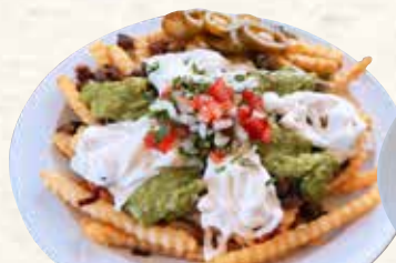
Asada fries 14