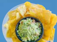
Guacamole y chips 10.99