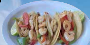
Tacos de Camarón 3 x 14.99