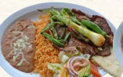
Carne asada 17