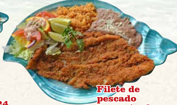
Filete de pescado empanizado