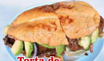
Torta de Milanesa Bistec 13.50 13