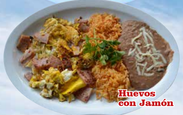
Huevos con Jamón