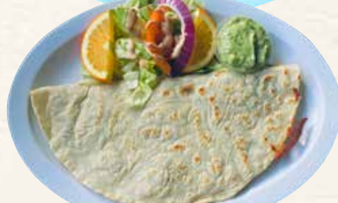
Quesadilla de maiz 13.99