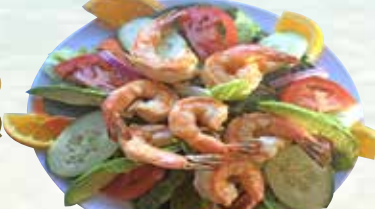
Ensalada de Camarón 16