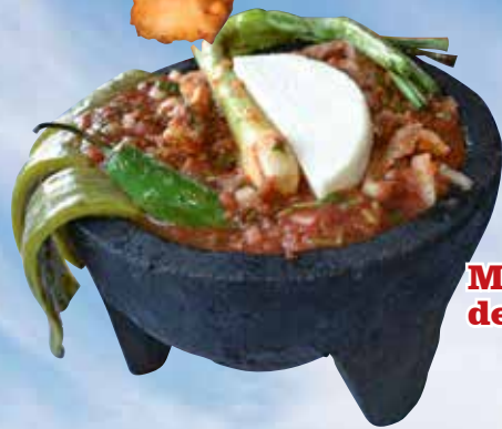
Molcajete de carne