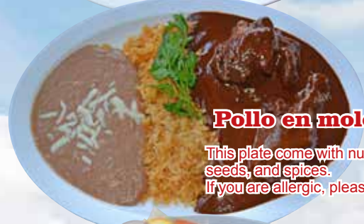
Pollo en mole

This plate come with nuts, seeds, and spices. If you are allergic, please ask