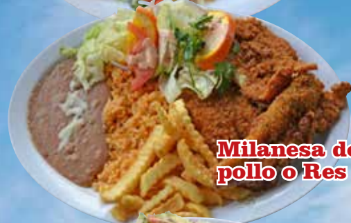
Milanesa de pollo o Res