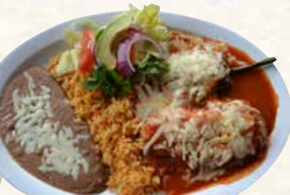
Chile relleno 18