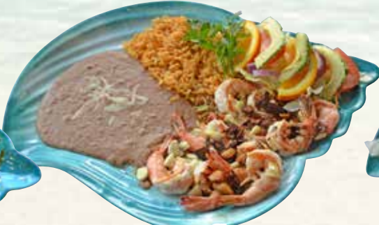
Camarones y pulpo al mojo de ajo 24