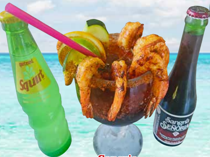
Sangria Preparada 15