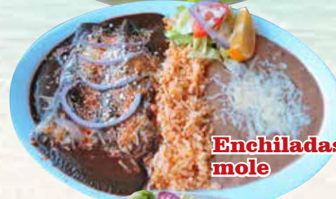
Enchiladas de mole