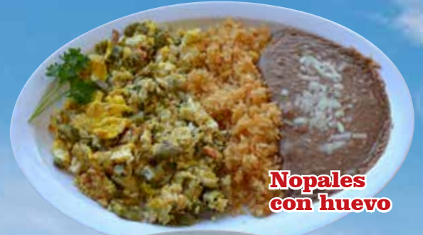
Nopales con huevo