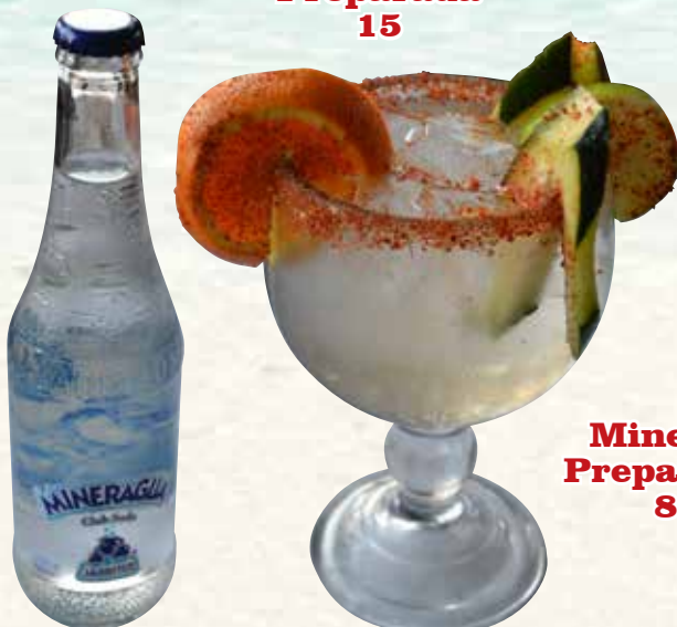
Mineral Preparada 8