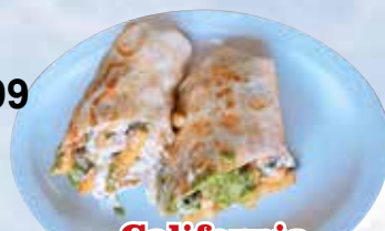
California Burrito fish or shrimp 14.99