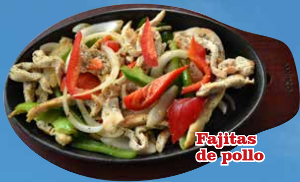
Fajitas de pollo