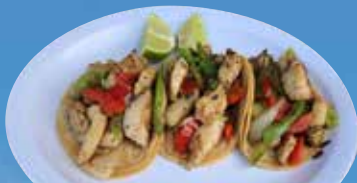
Tacos de Pescado 3 x 14.99